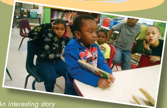
An interesting story