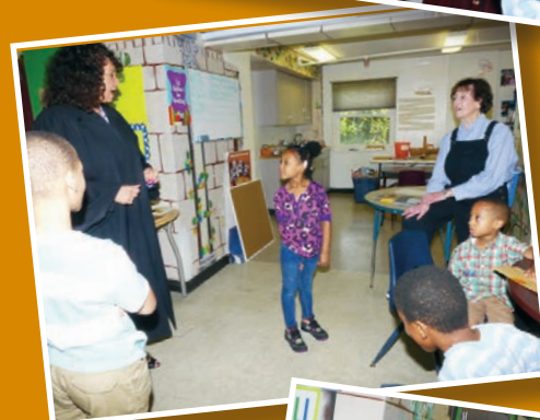
The Judge hears testimony in a "Small Claims Court" suit