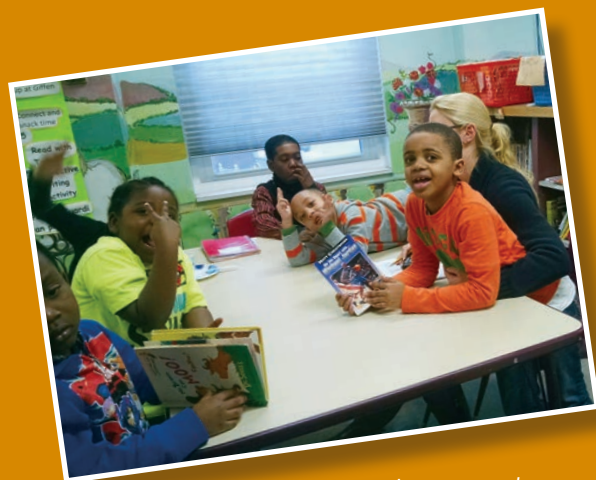
Listening is learning