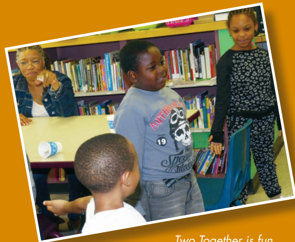
Two Together is fun