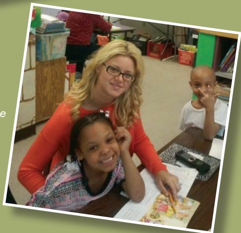
Working one on one